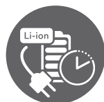
Cord/Cordless 2h use | 1h10 charge