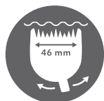
BLENDING BLADE 0.5 – 2 mm

Lightweight and powerful with long-life brushless motor and 2 precision blades.